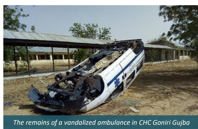
LGA Yobe state.

At the onset of the insurgency/crisis, healthcare providers and community members were displaced and fled for safety. Thirty-three PHCs and two secondary facilities were vandalised across seven local governments. Curfews and restriction of vehicular movement cut off access to hard to reach areas, across seven local government areas. The major towns of Damaturu, Potiskum, Gashua and Nguru witnessed an influx of displaced persons thereby overburdening the existing health infrastructure