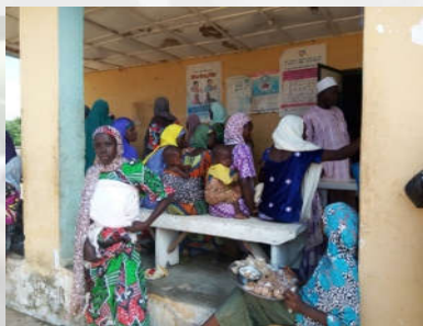
Mothers waiting for routine immunisation in Guga health facility, Bakori LGA.