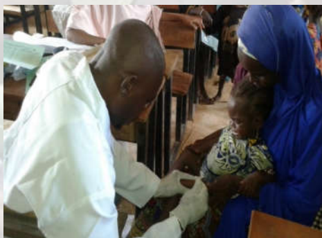
Routine Immunisation session at Makoshi Community PHC, Dawakin Takwas, Maradun LGA.