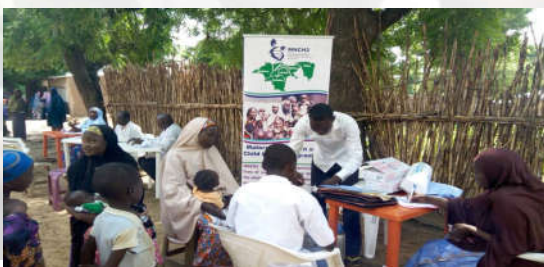
Routine Immunization session at Dan Tudu village PHC, Maska catchment settlement, Funtua LGA

"I really appreciate the efforts and contributions made by MNCH2 in improving maternal and child health through the capacity building and regular supportive supervision"