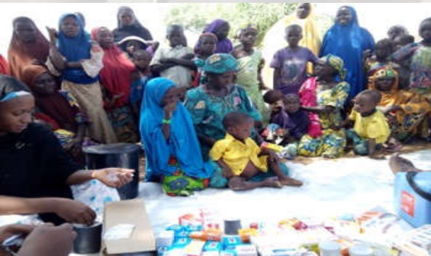
MNCH2 Outreach team supporting IMCI at Gumayamari community in Yusufari LGA

“Our committee is up and doing, mobilising communities around the health facility to avail themselves of the services it provides. MNCH2 has created a robust relationship between the health facility and the community through the facility health committee (FHC).”