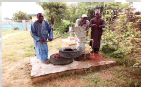
Facility Health Committee members renovate the borehole at Barayar Zaki PHC, Anka LGA