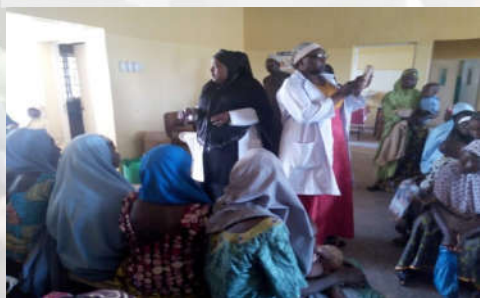
Service providers giving a health talk during an ANC and RI session at Gangara PHC, Giwa LGA

MNCH2 supported the State Government with the production of A-3 micro-plan templates (for annual work plans) for distribution to 963 health facilities and 255 wards across the state; data implementation and supervision tools; printing of promotional materials for the flag-off of the biannual Maternal & Child Health Week celebrations.