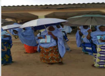
Traditional birth attendants equipped with kits after a 4-day training at Daura LGA