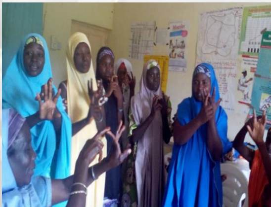
Cross section of women during a facility scorecard focus group discussion at Tudun Maiduna community, Malumfashi LGA