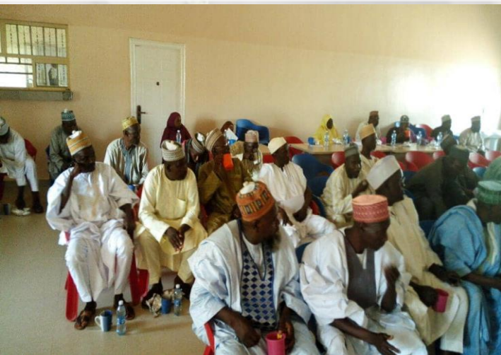
Cross section of participants at the final review meeting of the Family Planning Costed Implementation Plan (CIP) that held in Dutse.