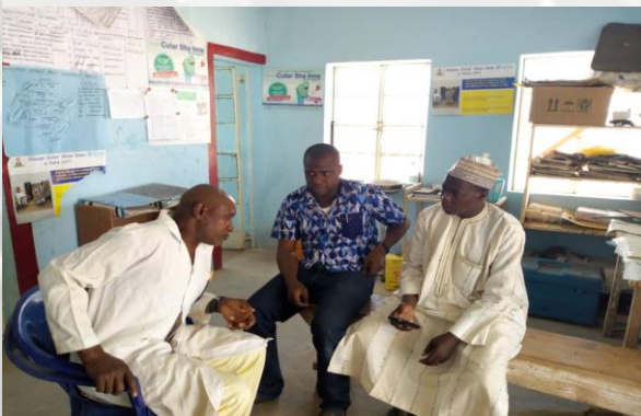
MNCH2 team during field visit on Health Facility assessment for BHCPF at Abdullawa PHC Kaita LGA.