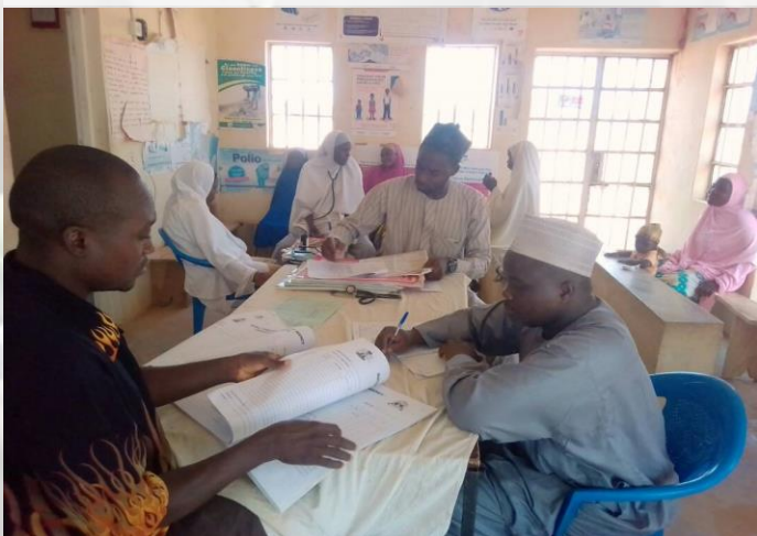
Trained Local Technical Assistant conducting Data Review and Validation at Tudun Yammama community, Kurfi LGA

“ We are so grateful that almost all LGAs have one or more facilities renovated. Therefore, we would try our best to secure the commodities given to us for the betterment of the members of the communities especially the less privileged and vulnerable”