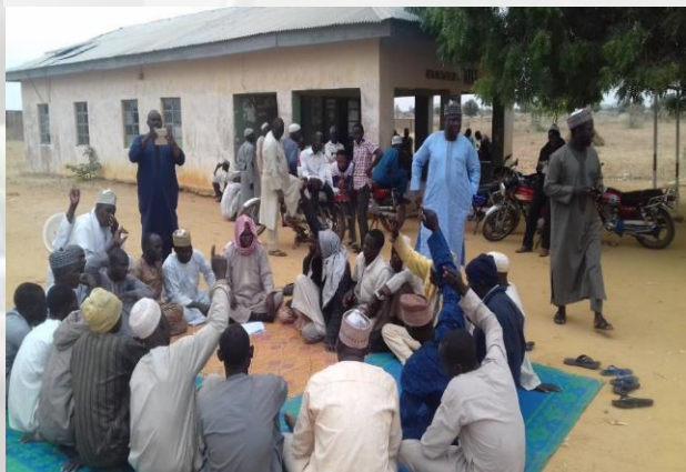
Community and religious leaders at an FHC meeting at Shargalle PHC, Mashi LGA.